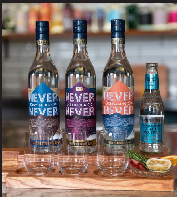
Gin Tasting Paddle

WIFI FREE CAR PARKING ON SITE LINEN PRIVATE BAR PRIVATE BATHROOMS EXTRA SET-UP TIME