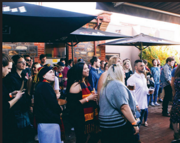
Beer Garden, Game Day

Off: Feb 1 - Oct 30 // On: Oct 31 - Jan 31