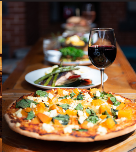
A La Carte