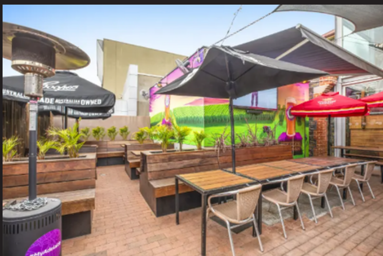
The L-shaped Beer Garden

Whether for a reunion, pub crawl, bucks show, hens night or place to watch all the big games, The Archer's Beer Garden can accommodate.