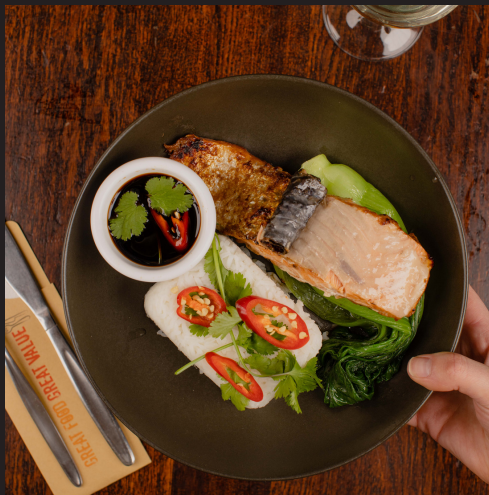
Teriyaki Salmon Fillet

The room has direct & private access to the back bar whilst being predominantly secluded from the noise of the front facade. Perfectly suited to business lunch meetings, conferences, mixers, dinner parties and smaller birthdays.