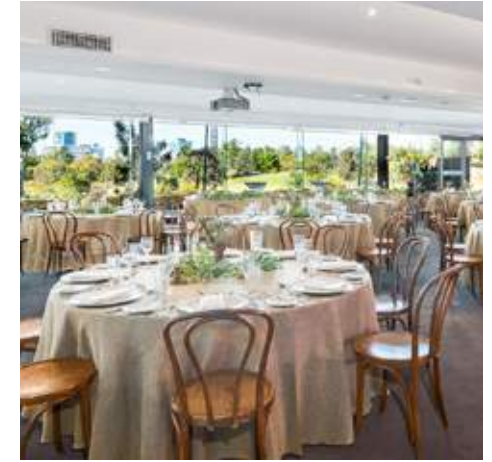
ALABASTER ROOM 90 seated | 120 cocktail