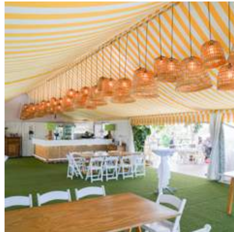
ORCHARD 60 seated | 100 cocktail