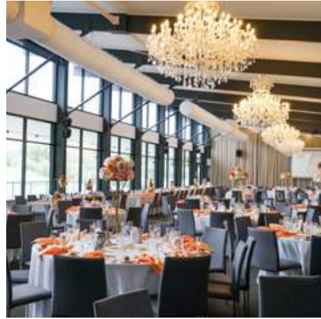
BALLROOM 260 seated | 550 cocktail