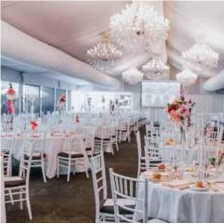
THE MARQUEE 420 seated | 700 cocktail