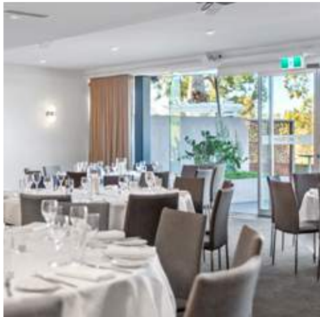
QUARTZ ROOM 50 seated | 80 cocktail