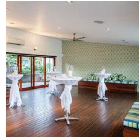
PUTTING LOUNGE Min 30 | Max 70