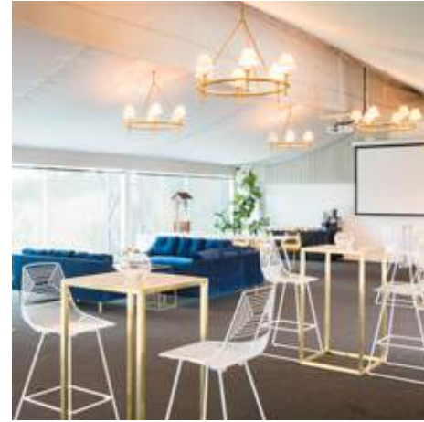
GARDEN MARQUEE 110 seated | 120 cocktail