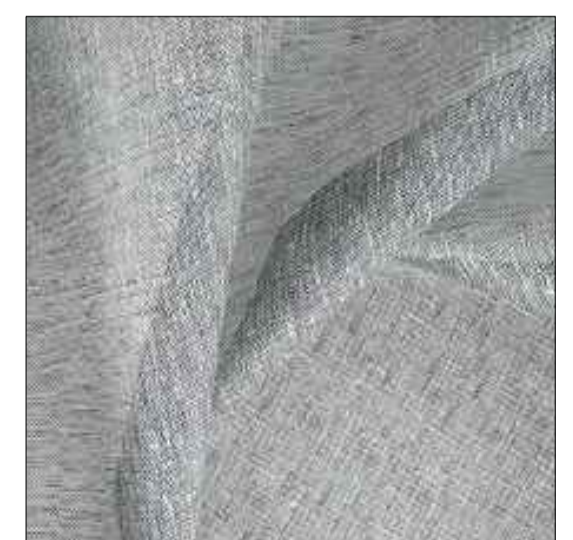
03 REFERENCE IMAGE SHEER CURTAIN DETAIL

SHEER CURTAIN ZEPPEL ALLUSION, LIQUORICE CONTACT: ZEPPEL MELBOURNE SHOWROOM MELBOURNE@ZEPPELFABRICS.COM 03 9481 2089