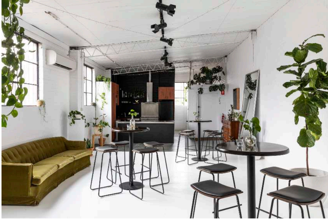
Cocktail Furniture Hire Package