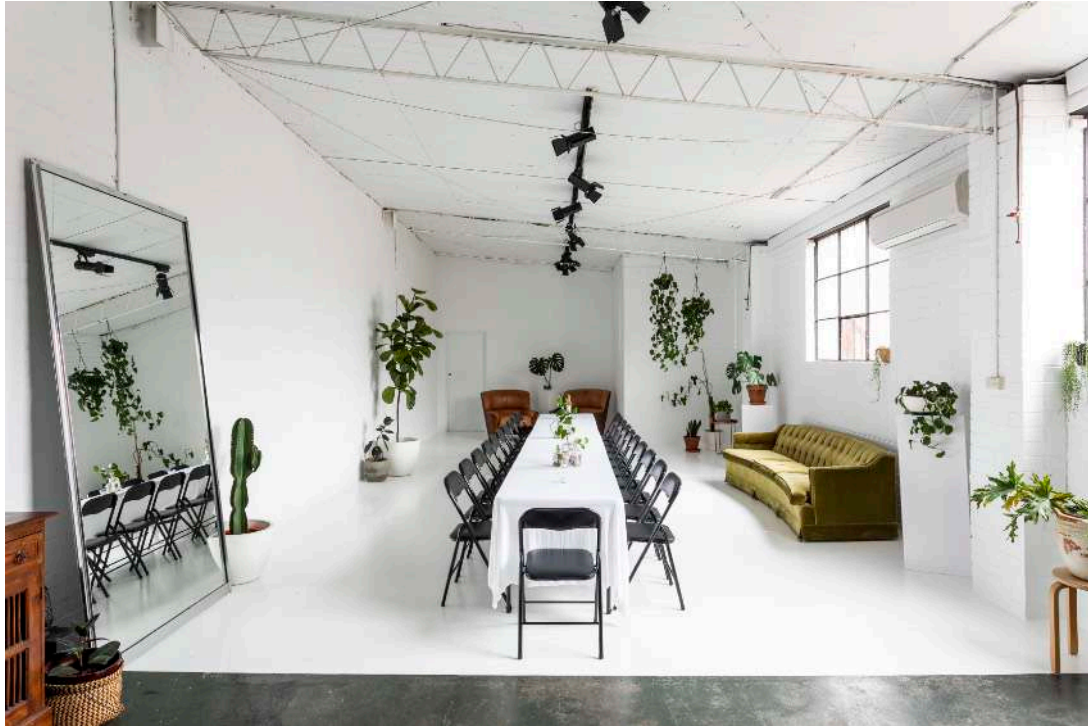
Sit-Down Furniture Hire Package